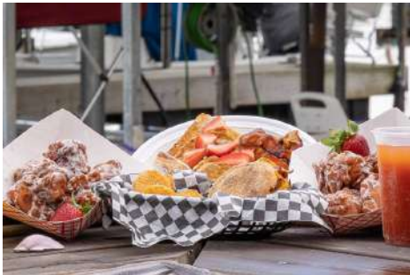
Breakfast now being served Dockside Cooked to order Eggs, French Toast, Breakfast Burritos, Crab Cake Benedict and more!