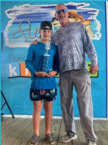
Colton and Captain Julius very

Walt stayed busy this weekend at the fish cleaning station.